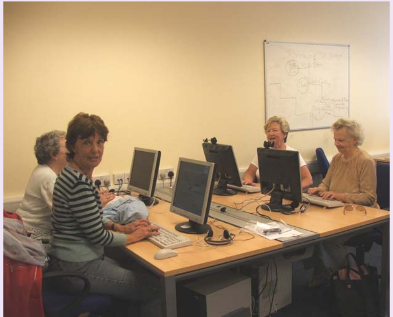
Internet Café DLVEC Community Based Education Support Service Centre 61 Mulgrave St, Dun Laoghaire

Drama, Creative Writing, and Arts & Craft courses are also part of the Community Education Programme providing opportunities for exploring creativity together and many groups have put on exhibitions, published books and performed in public.